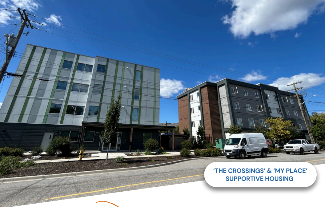
'THE CROSSINGS' & 'MY PLACE' SUPPORTIVE HOUSING