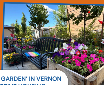
'MEMORIAL GARDEN' IN VERNON SUPPORTIVE HOUSING